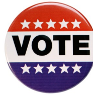
PHOTO ID: NO PHOTO IS REQUIRED UNLESS IT STATES THAT YOU MUST SHOW PROOF OF RESIDENCE.

Out of Precinct Voting: Voters who appear on Election Day in the correct county but in the improper precinct may cast a provisional ballot, which will be counted for all contests in which the voter was eligible to participate.